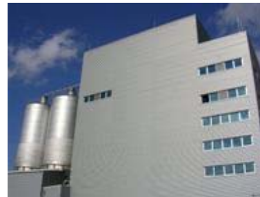
2-Reactor Polycondensation Plant