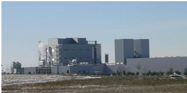
Complete Plant including film line

Since November 2006 the second line is successfully in operation.